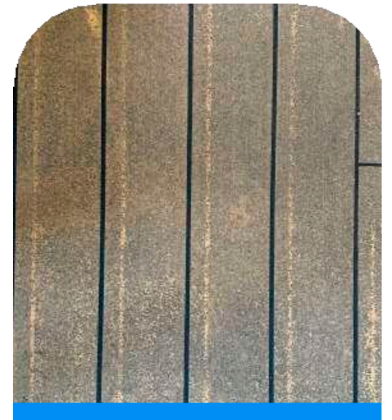
Before applying Floor Scrub

For Light/Daily Maintenance use the following steps: